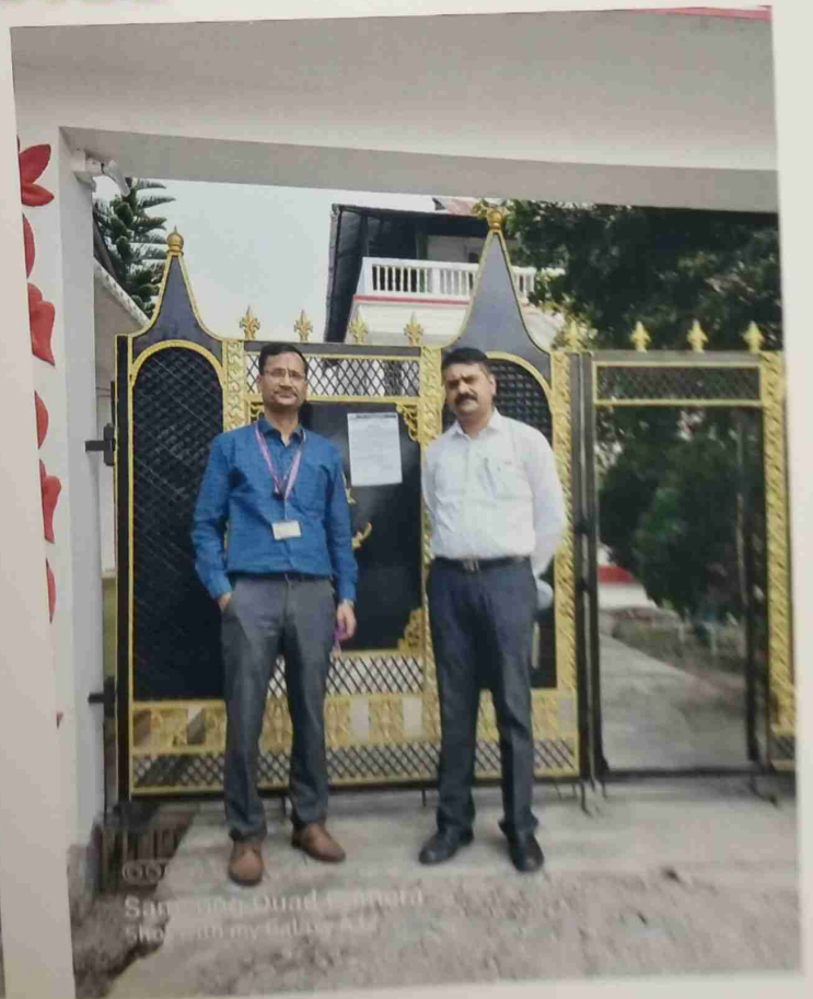
Samsung Quad Camera Shot with my Galaxy A32