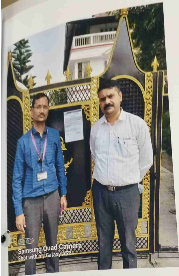
Samsung Quad Camera Shot with my Galaxy A32