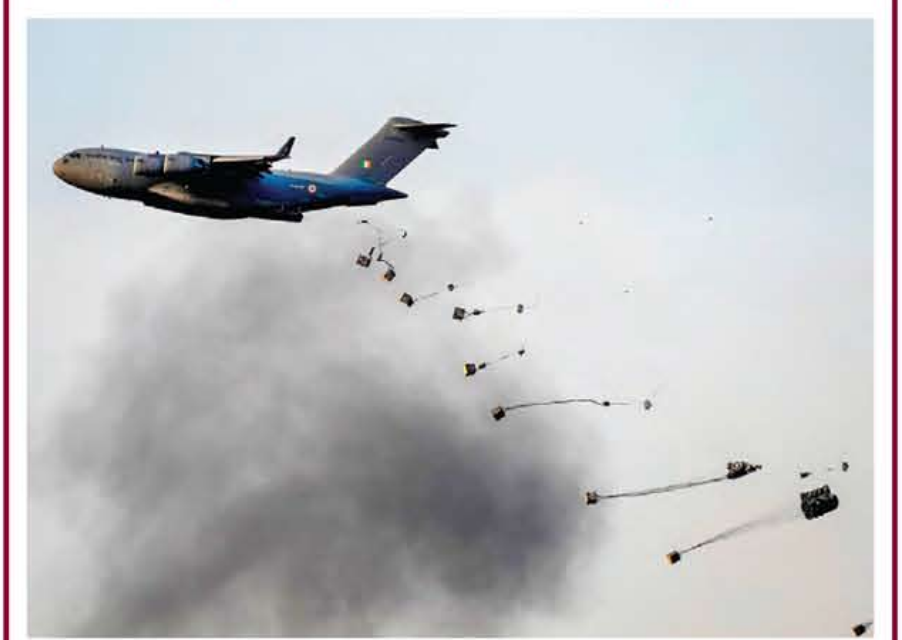
IAF's C-17 Globemaster III during the Vayu Shakti 2024 exercise at Pokhran Range, in Jaisalmer district.